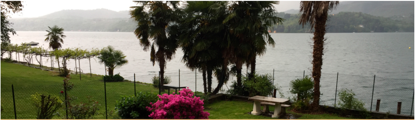
Orta Rustico · Lago d'Orta · Via Novara 6 · 28016, Orta San Giulio, Italy

You are travelling from Verbania via Omegna to Orta. Here, at the roundabout, you will see a hotel built in the style of a mosque-like palace with a minaret tower.