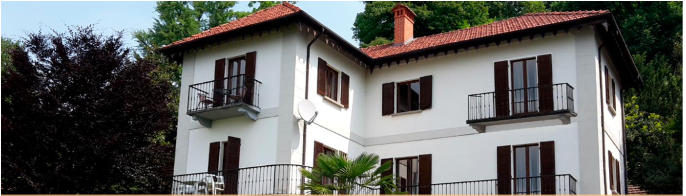
Villa Orta · Lago d'Orta · Via Novara 6 · 28016, Orta San Giulio, Italy

You are travelling from Verbania via Omegna to Orta. Here, at the roundabout, you will see a hotel built in the style of a mosque-like palace with a minaret tower.